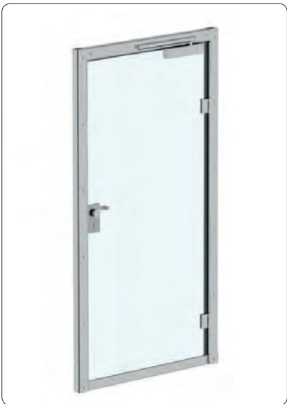
Door with standard locking system

Glass doors with standard locking system or safety doors with access control