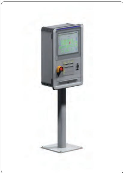
Control terminal (HMI)

for access control and monitoring filter system