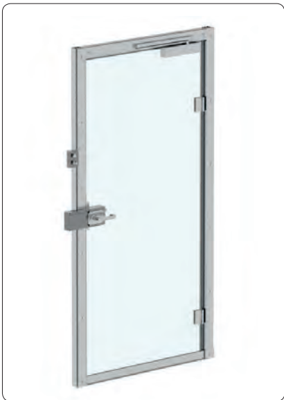
Safety door with access control

Ventilation system with F7 (pre-filter) and F9 (main filter)